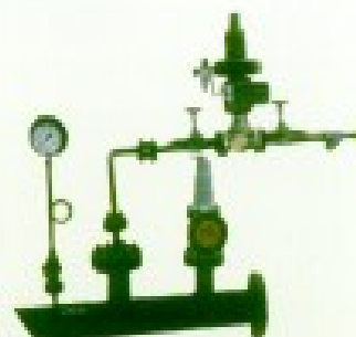
WATER CONTROL ASSEMBLY FOR DESUPERHEATING.