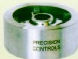
FLOW CHECK VALVE