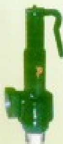
GUN METAL SAFETY VALVE